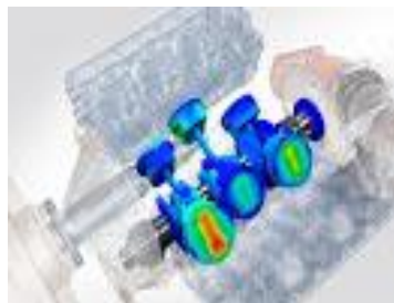
Ex. Digital Prototype